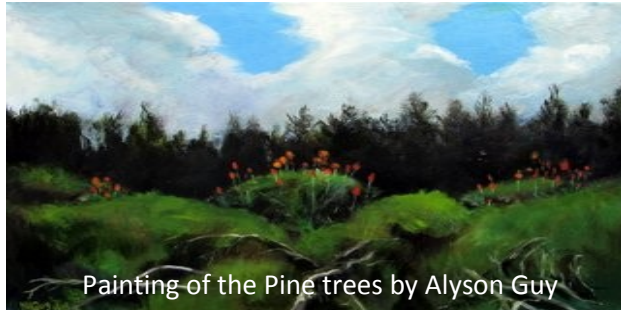
Painting of the Pine trees by Alyson Guy

On your next visit to Volmoed you will notice that we have started clearing some of the alien trees with the row of Pine trees in front of Die Nessie and Oak Cottage. We are looking at replacing them with indigenous trees which will be able to tolerate water, as the winter rains