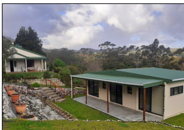
St Scholastica and St Benedict's Priory.