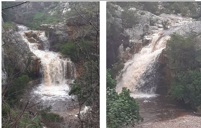
Brother Roger took these picture of the Waterfall and river on one of his walks along the pipe track.