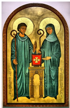
Icon of St Benedict & St Scholastica