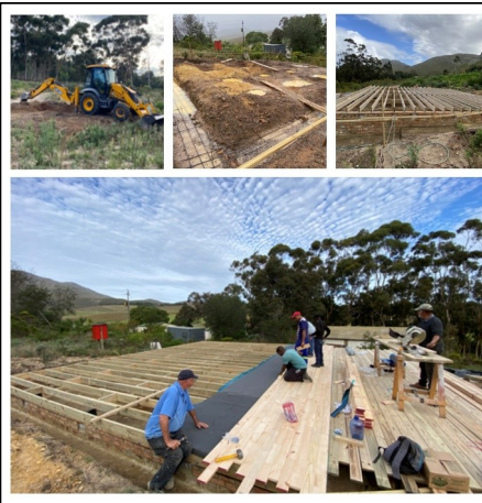
The building of my house has started.